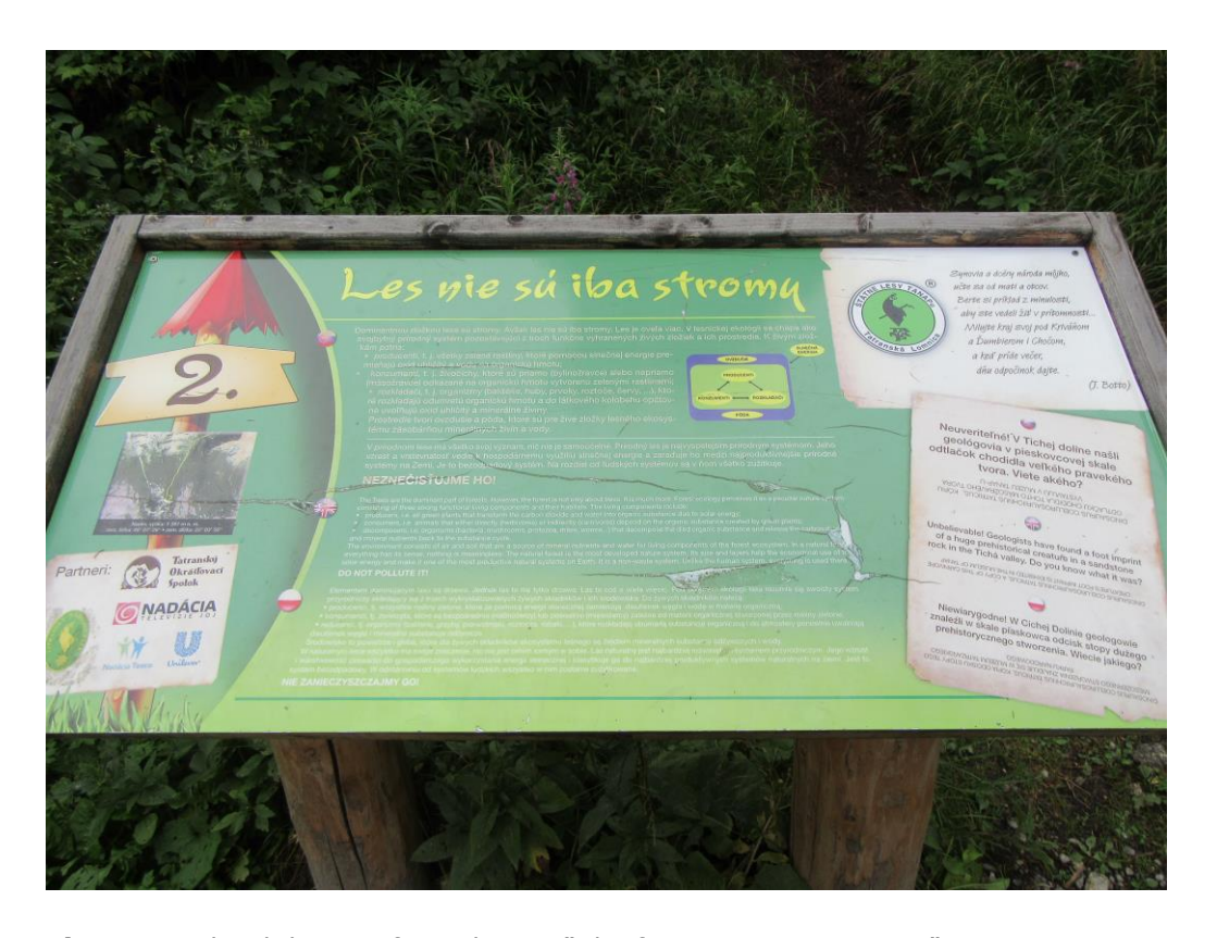
Fig. 3: Graphical design of panel no. 2 "The forest is not just trees"