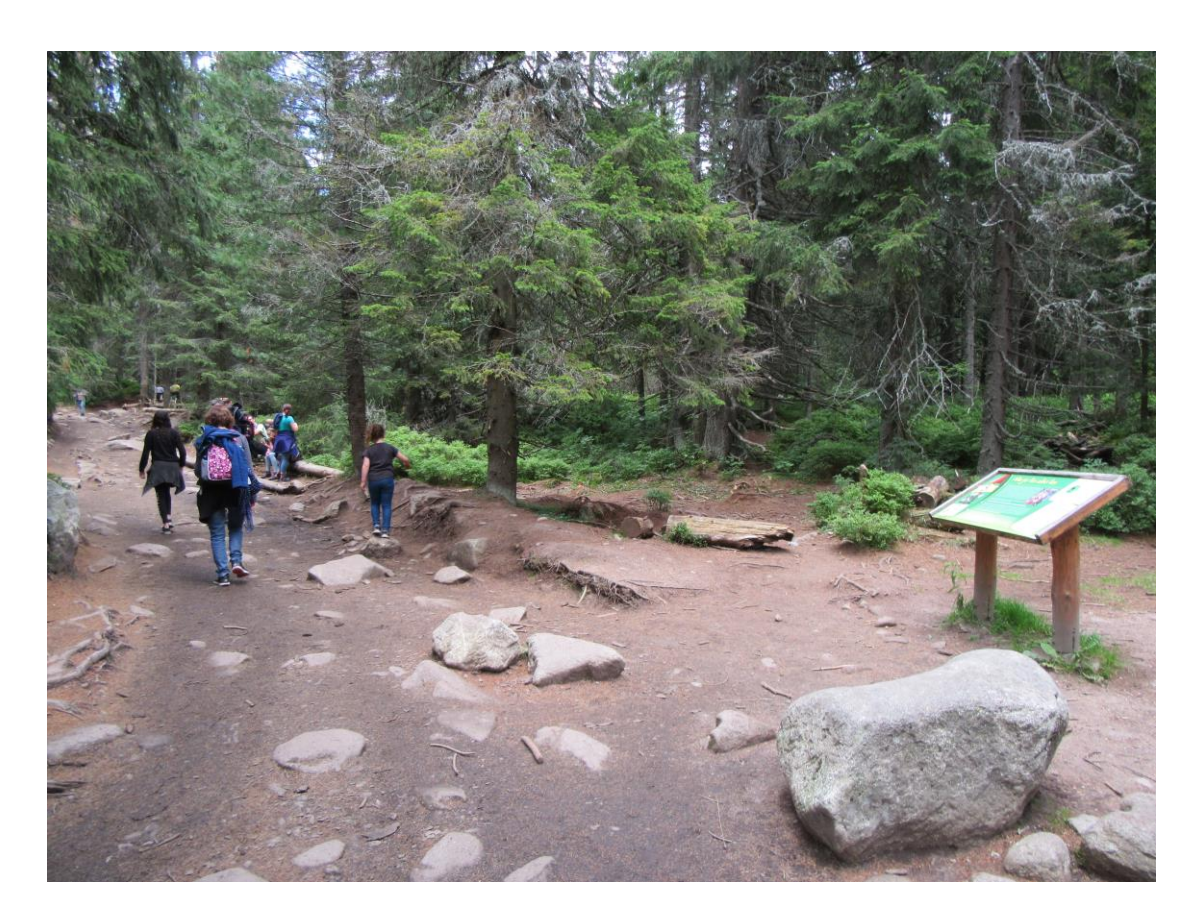
Fig. 2: Location of panel no. 5 "There is no forest like a forest"

"Forest and avalanches" but apart from the information about the avalanche accident, there is no connection with the forest.